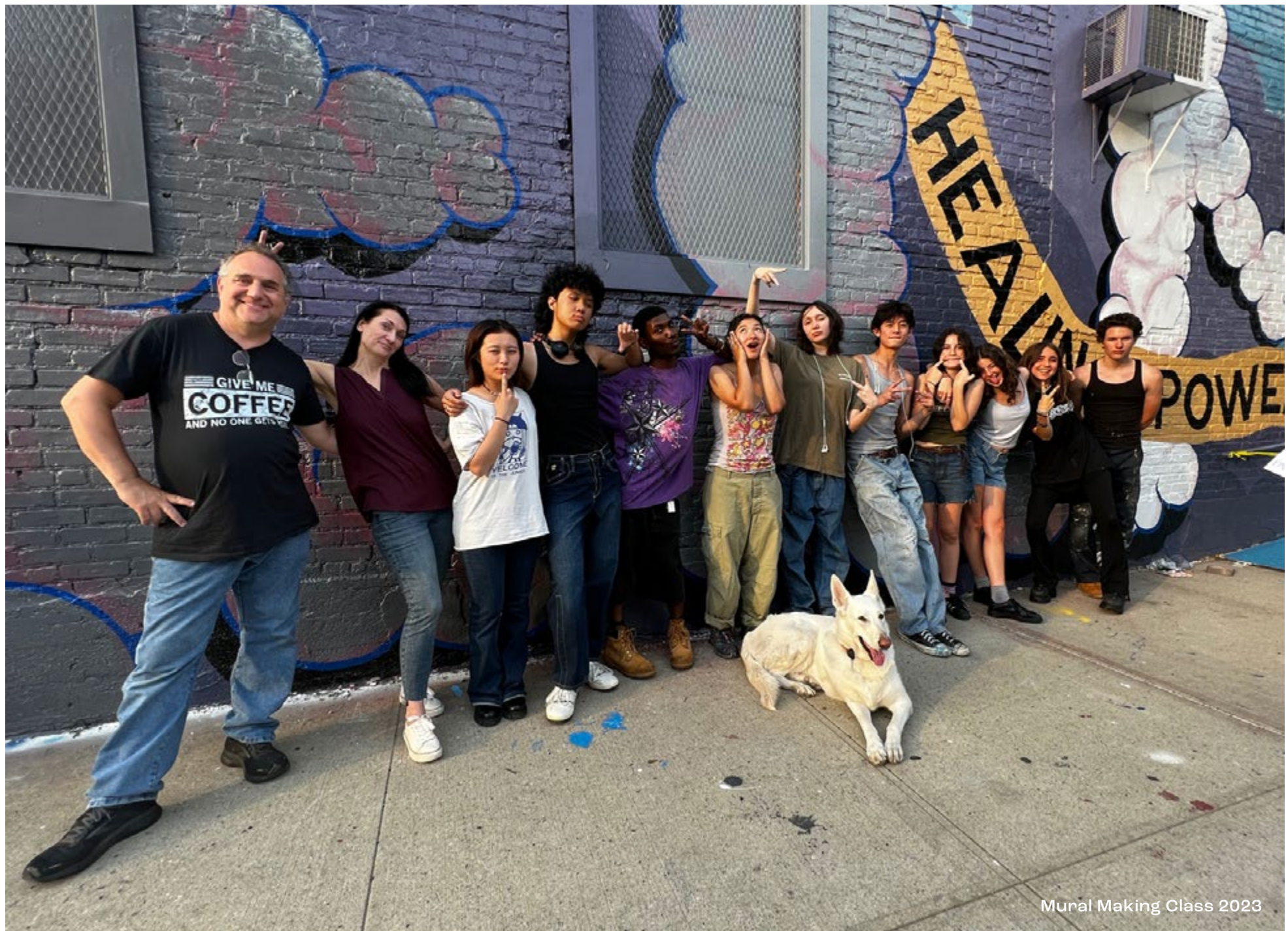
Mural Making Class 2023