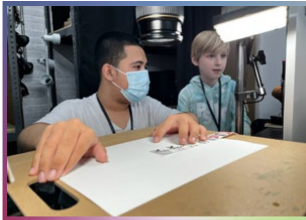
FILM & ANIMATION

Students learn techniques, and creative applications of screen printing. Through hands-on demonstrations and design exercises, students develop their own unique prints.