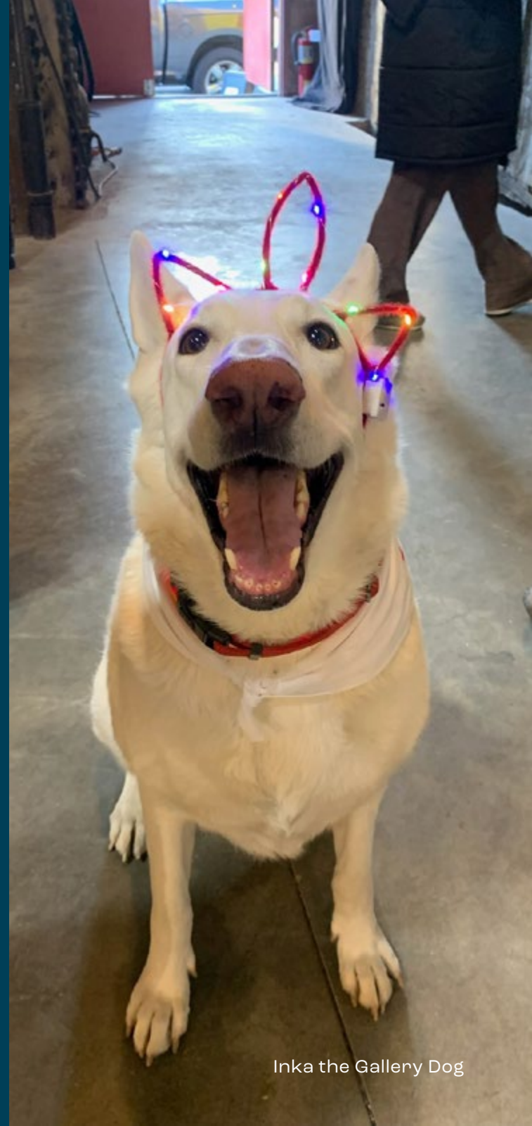
Inka the Gallery Dog